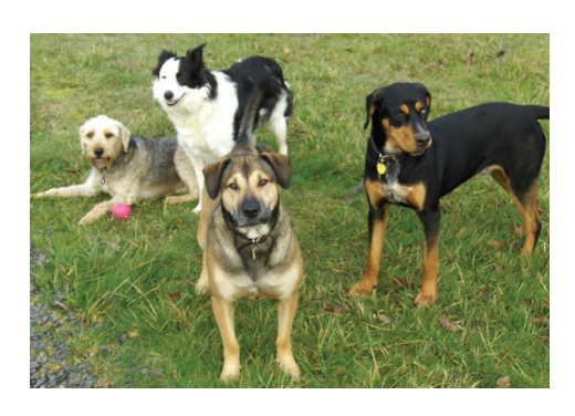
"Thanks so much for saving me, and for helping me find my happy, forever home!"

Both my new family and my friends at SARA worked patiently to help me get over my separation anxiety. It took me about six months to settle down and realize that I had finally found my forever home, but now I couldn't be happier!