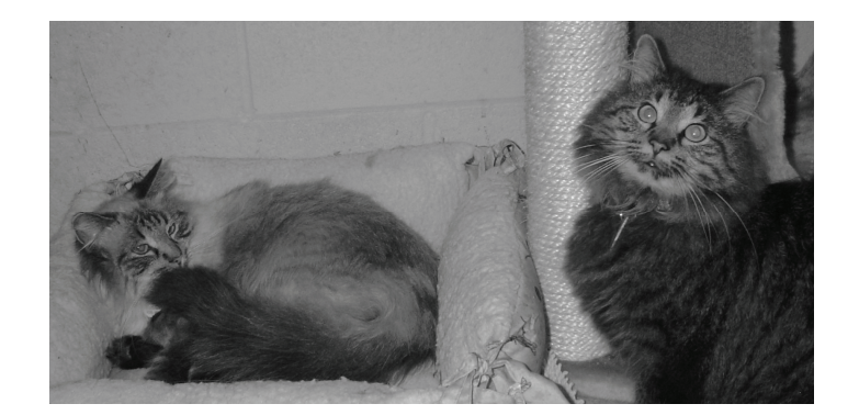
Jellybean & Bonanza settling in at SARA's Treasures

By accepting Jellybean & Bonanza into our rescue program, they were spared the stress of the traditional shelter environment, and were able to benefit from SARA's personalized adoption program.