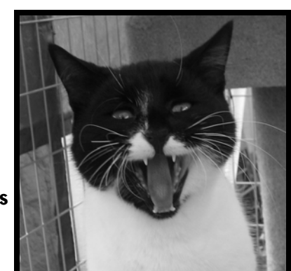
Gonzo - Available for Adoption

Donated items can be dropped off at S.A.R.A.'s Treasures10:00-6:00 Every Day