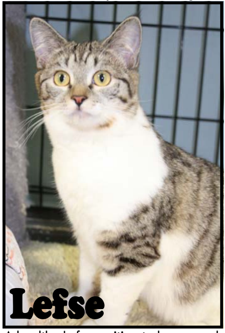
A healthy Lefse waiting to be spayed.

Luckily, all of the cats are doing great, and unlike at traditional shelters, no one was killed because of a fungus.