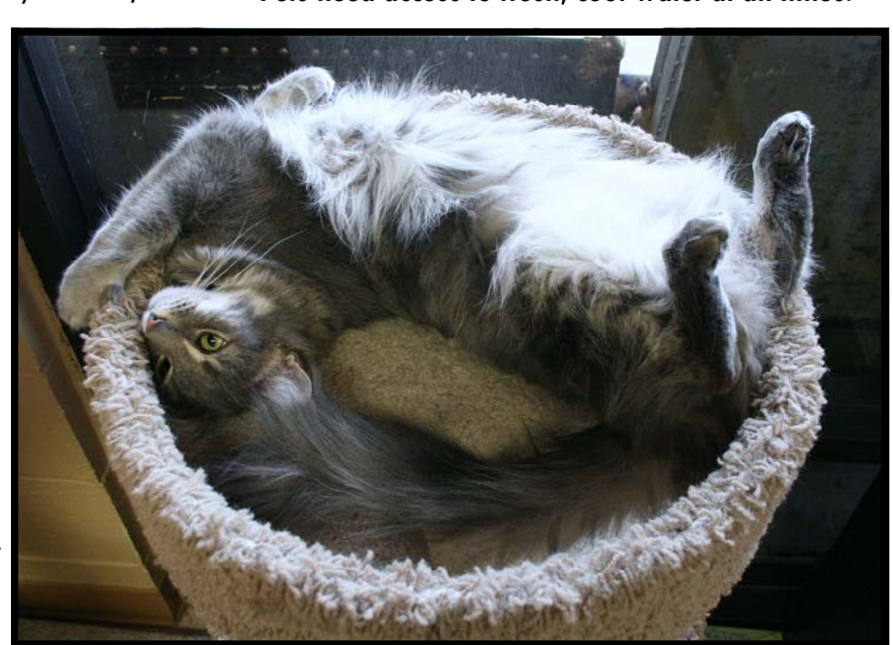
Bill enjoying the sunshine from the safety of his cat tree.

Pets need access to fresh, cool water at all times.