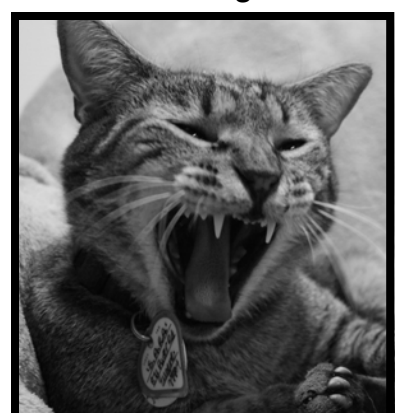
Angus - Available for Adoption

•Monetary Donations for Veterinary Bills and Medical Supplies