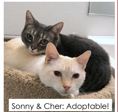
Sonny & Cher: Adoptable!

Meet Sonny & Cher, they are happy 8 year old life partners who have a similar story of being rescued from euthanasia after their guardian passed away. We can't seem to find any thing wrong with these two love bugs. They are very nice, affectionate cats who will make purrfect companions. They are both available for adoption now. Thank you all for your continued support, allowing us to save more lives in the years to come!