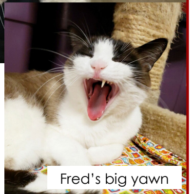
Fred's big yawn