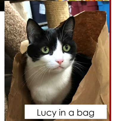
Lucy in a bag