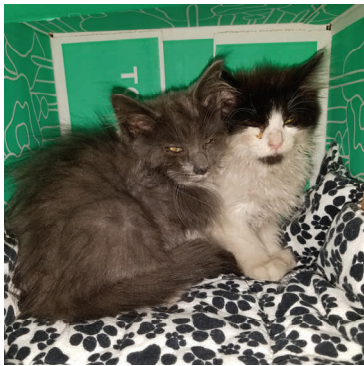
Pancake & Waffle's First Night at S.A.R.A.