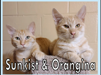
Sunkist & Orangina