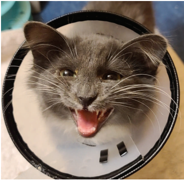
Waffle's Neuter Recovery