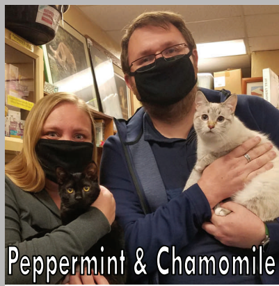
Peppermint & Chamomile