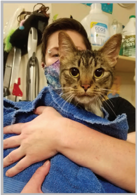
Millie, the 3-legged cat, being dried from her bath before her mom came to pick her up.